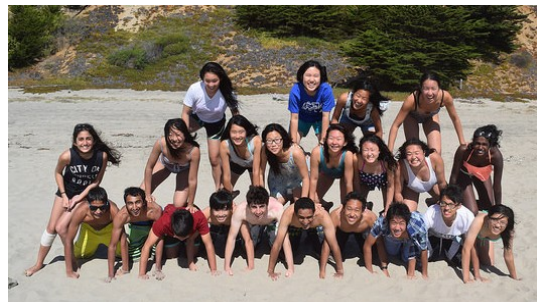
no pyramid scheme to see here